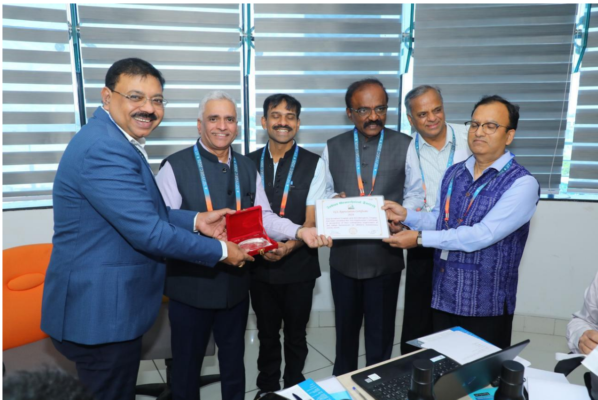
Got the opportunity to attend the inaugural day of the 2 nd International Conference on Civil Engineering Innovative Development in Engineering Advances (ICC IDEA 2025) at SRM Institute of Science and